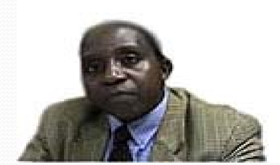
DAR ES SALAAM 2012